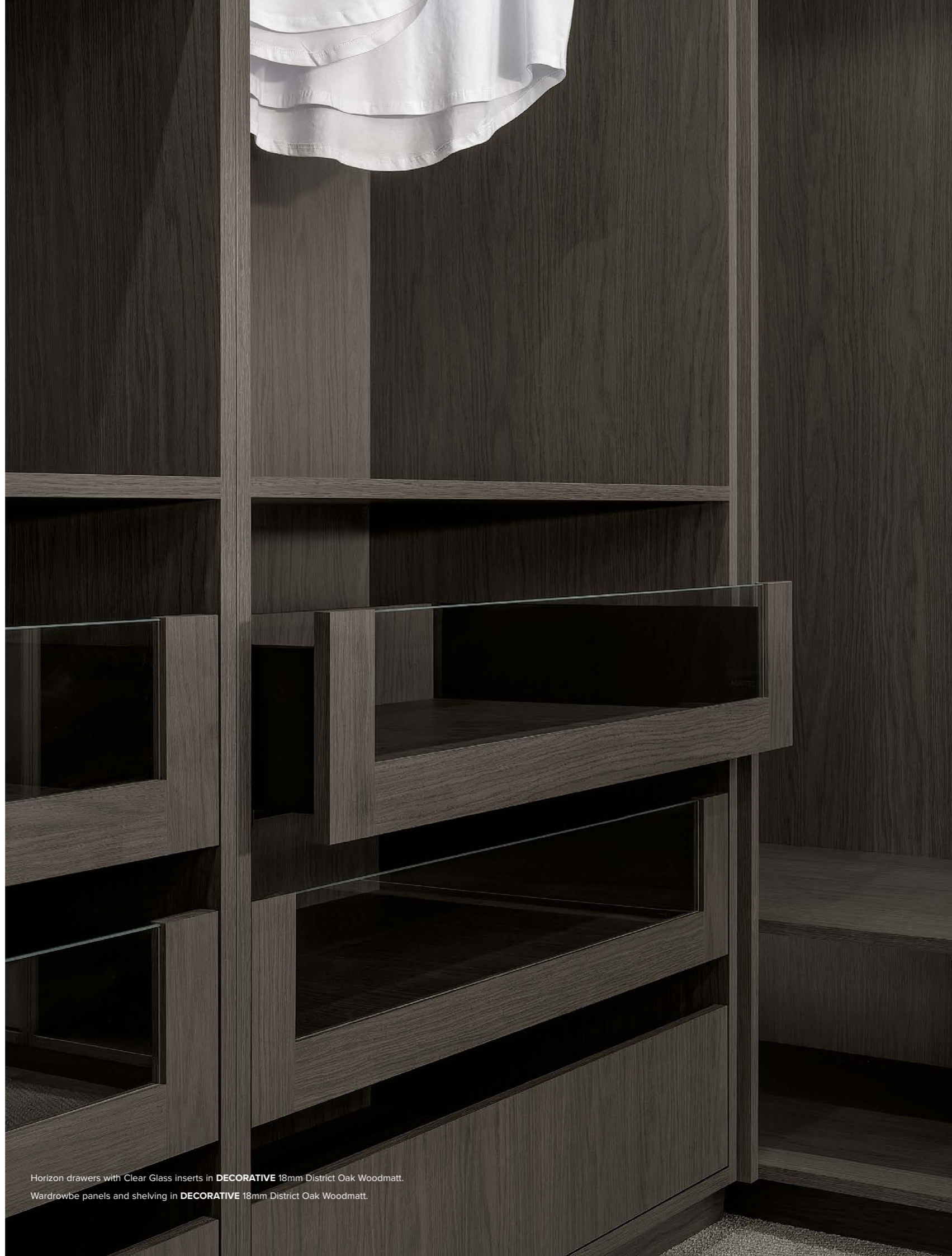
Horizon drawers with Clear Glass inserts in DECORATIVE 18mm District Oak Woodmatt.