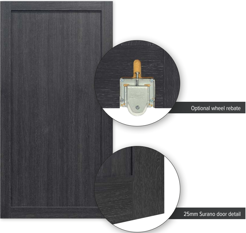
COVER IMAGE: 25mm SURANO wardrobe doors in Estella Oak Woodmatt.

Dark coloured surfaces will show fingerprints and require more care and maintenance than lighter coloured surfaces. It is recommended to test a product sample prior to colour selection. polytec swatches and samples represent a small area of the overall colour structure. To view the large colour sample, visit www.polytec.com.au .