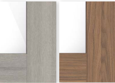
Mirror Starphire White Glass