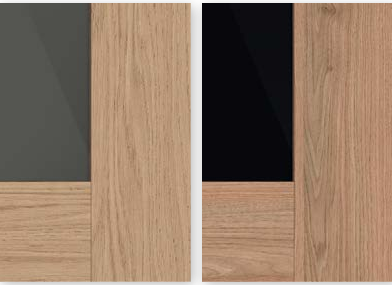
Smokey Grey Mirror Starphire Black Glass