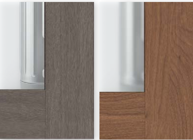
Clear Glass Frosted Glass