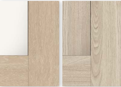
Contrasting Melamine Matching Melamine