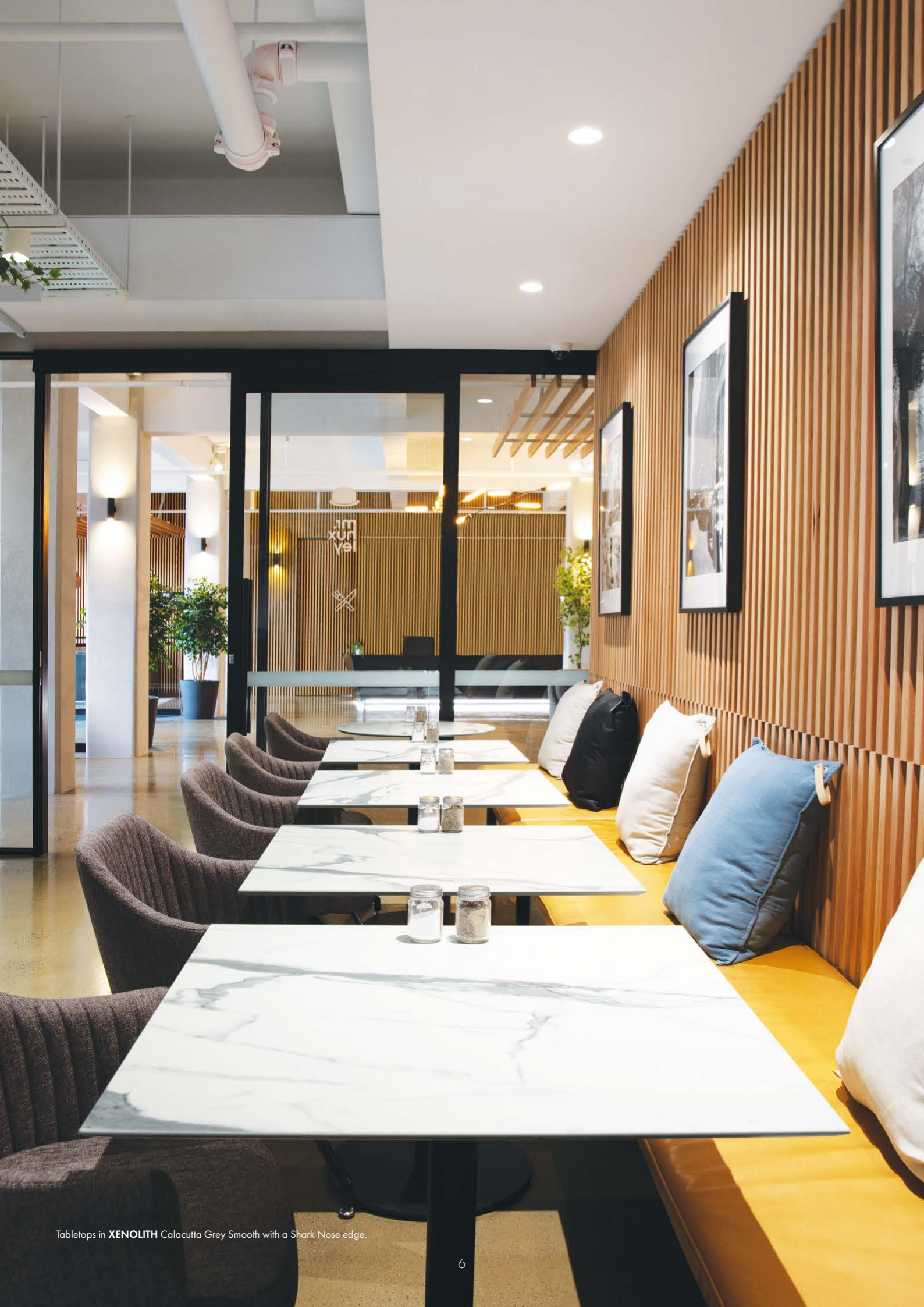
Tabletops in XENOLITH Calacutta Grey Smooth with a Shark Nose edge.