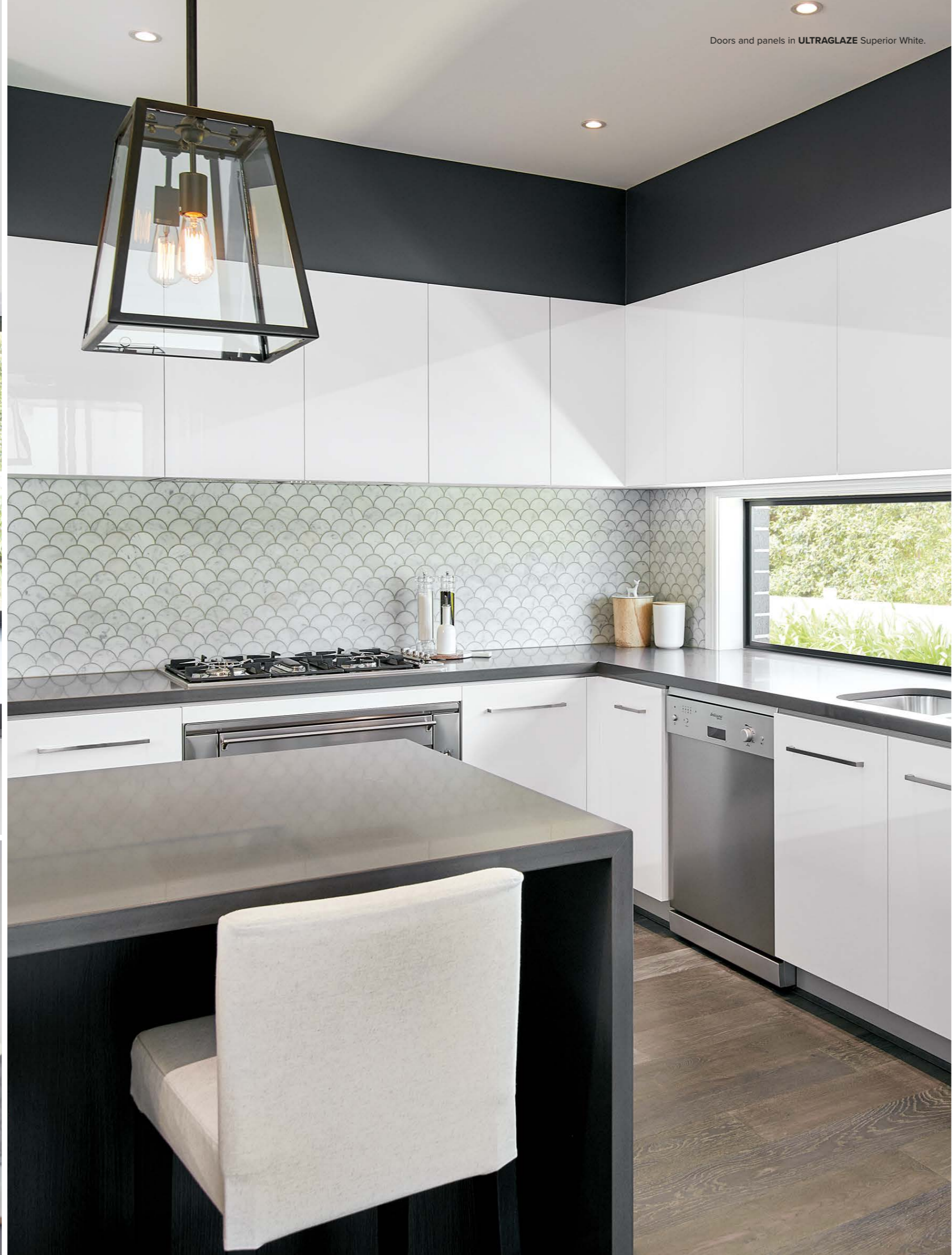
Doors and panels in ULTRAGLAZE Superior White .