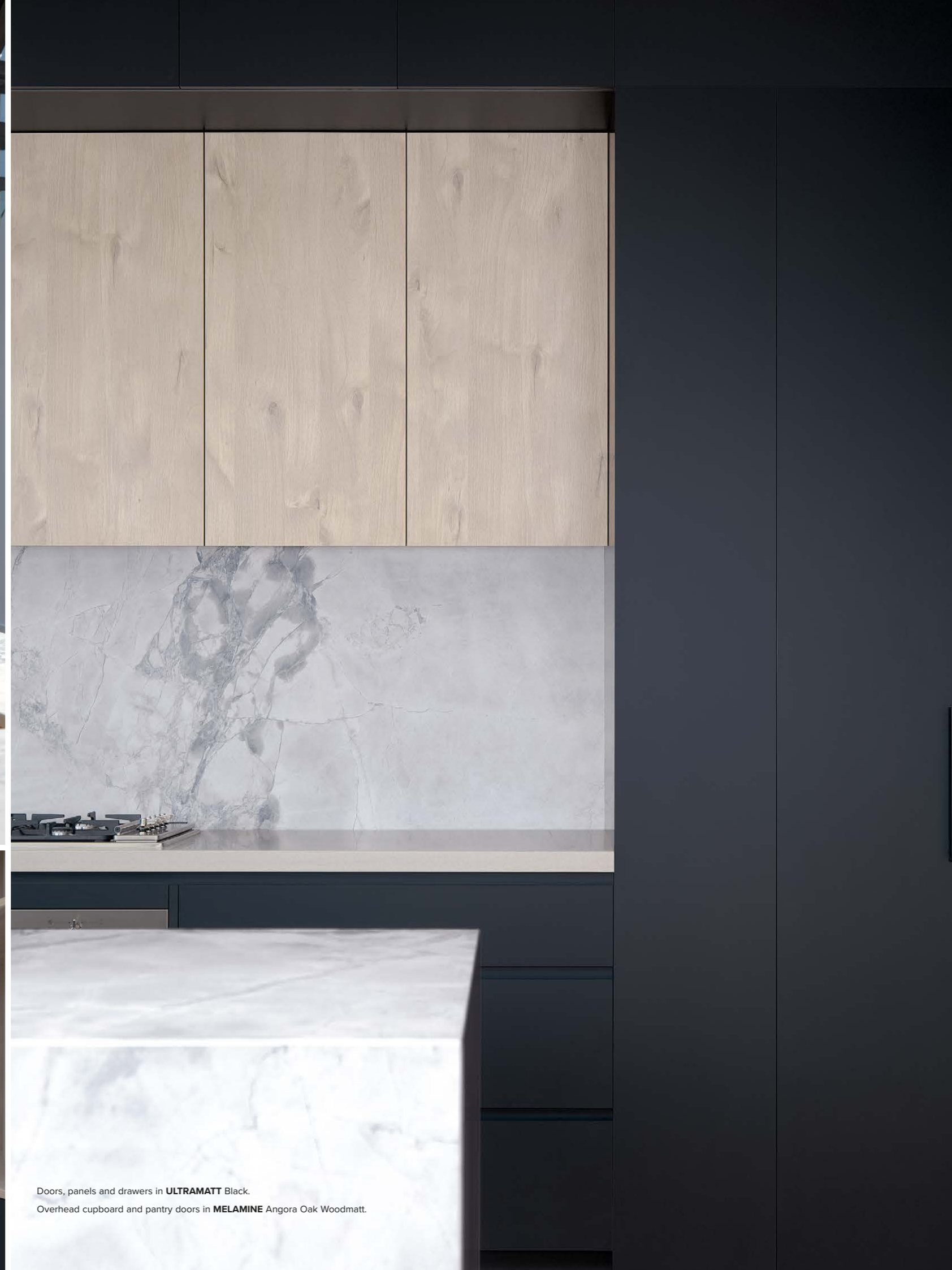
Doors, panels and drawers in ULTRAMATT Black. Overhead cupboard and pantry doors in MELAMINE Angora Oak Woodmatt.