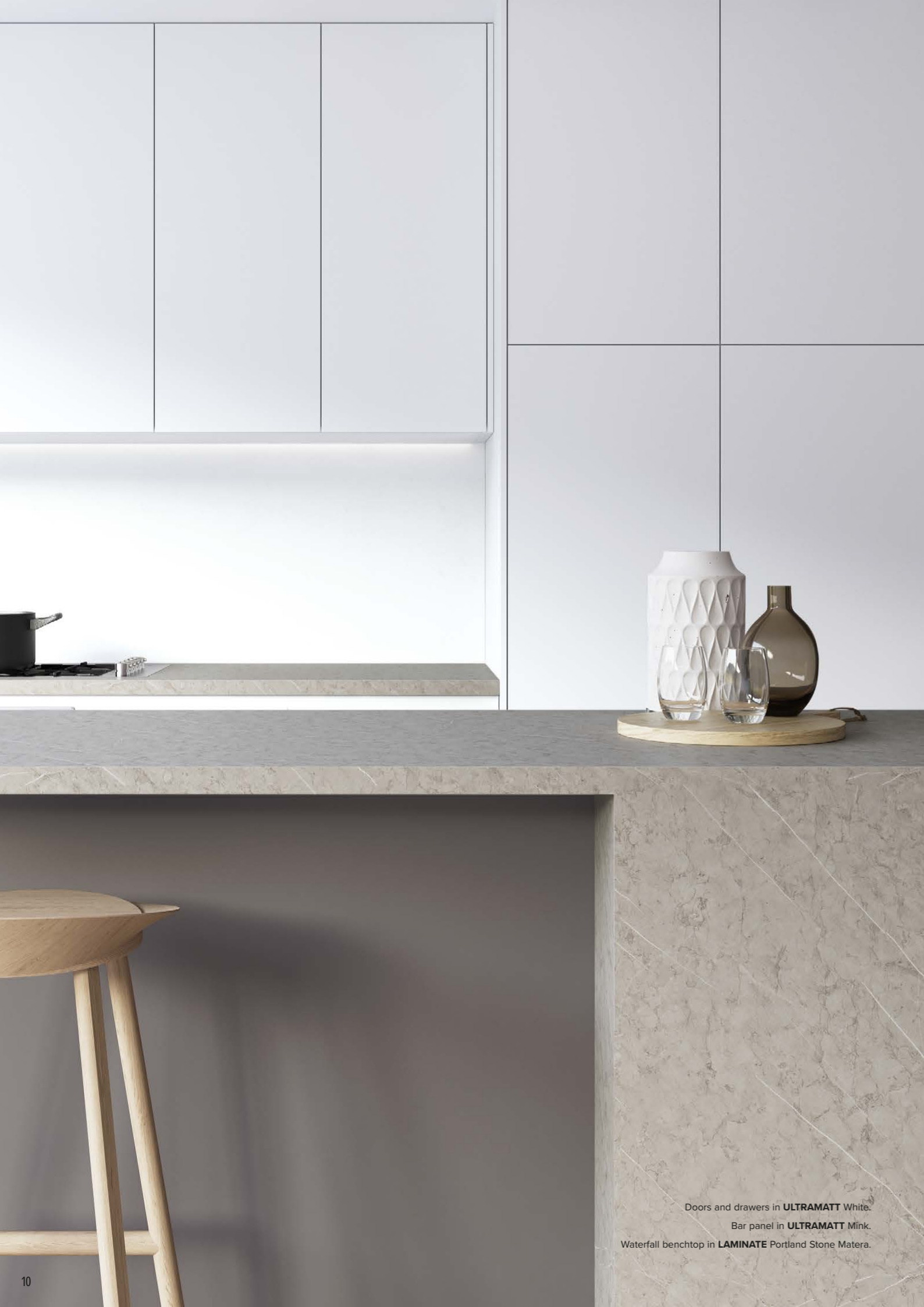
Doors and drawers in ULTRAMATT White. Bar panel in ULTRAMATT Mink. Waterfall benchtop in LAMINATE Portland Stone Matera.