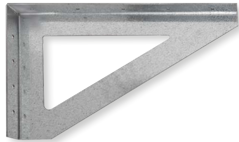
450 x 300mm Support Bracket

Drop Front benchtops & vanities are manufactured with a 45 degree mitred boxed front and available with boxed ends, sink and tap cutouts, delivered full fabricated. Wall brackets are available as an accessory.