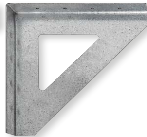
300 x 300mm Support Bracket

COVER IMAGE: Drop Front Benchtop in 13mm COMPACT laminate Tivoli Ceppo Smooth. Mirror Panels with Black edge.