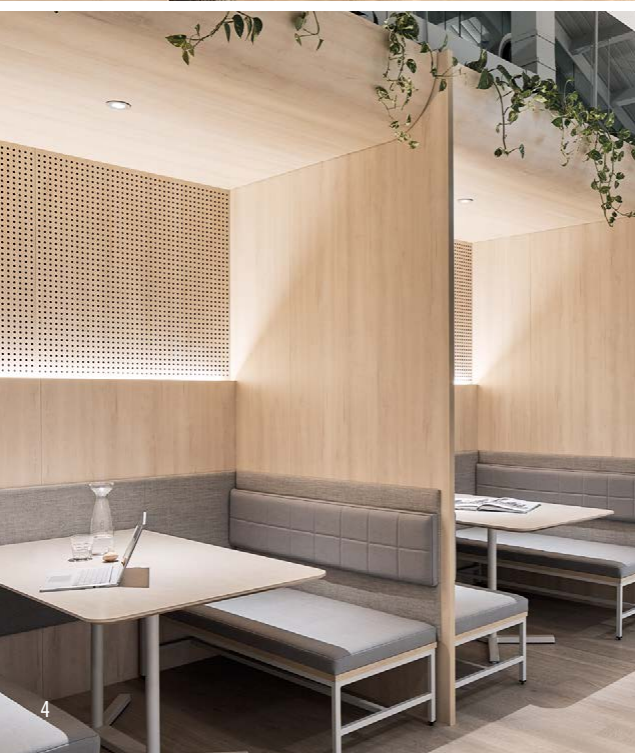
Vertical partitions in LAMINATE Nordic Oak Woodmatt. Bench seating in LAMINATE Nordic Oak Woodmatt.