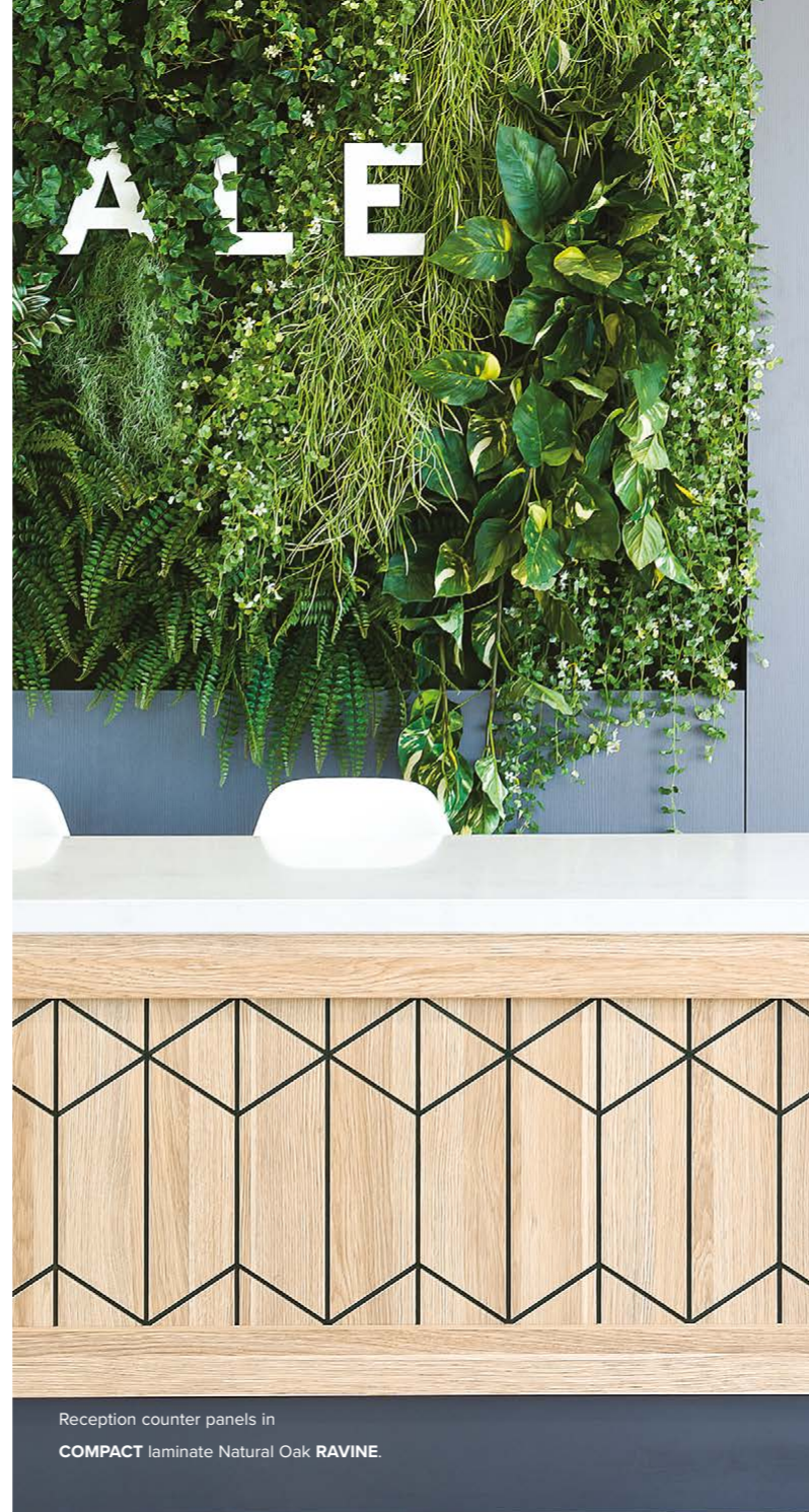
Reception counter panels in COMPACT laminate Natural Oak RAVINE.