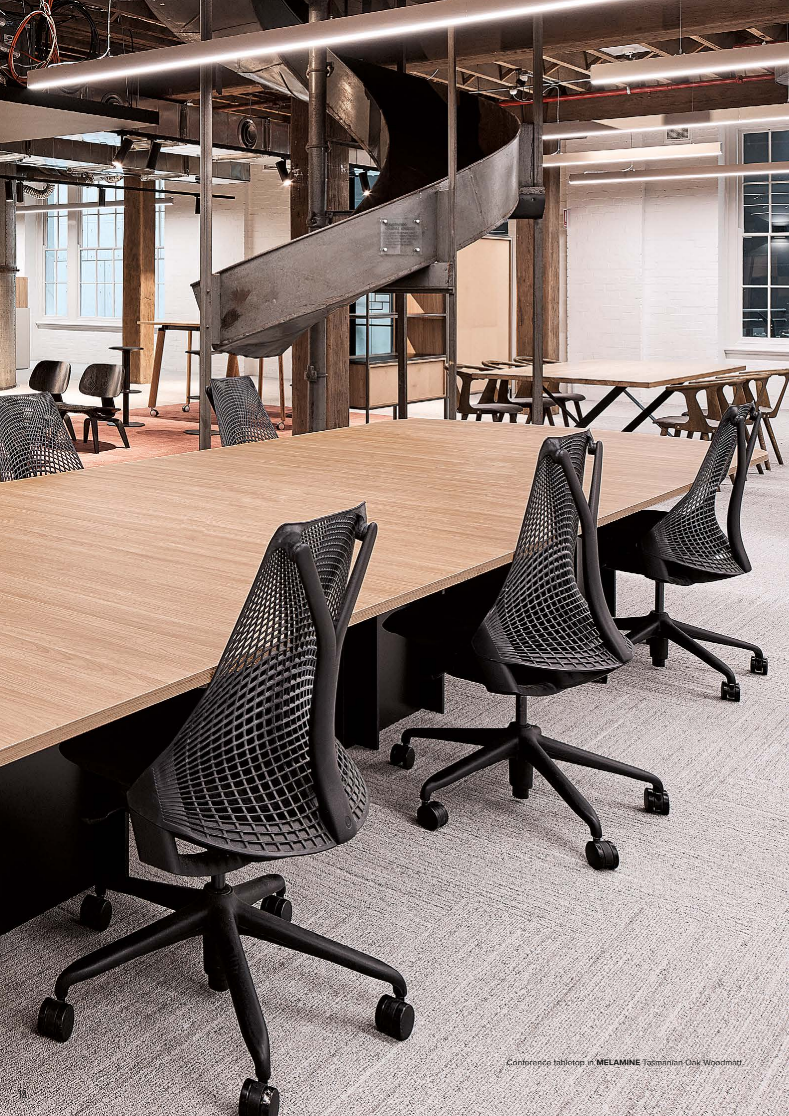
Conference tabletop in MELAMINE Tasmanian Oak Woodmatt.