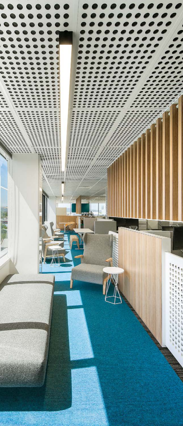
Table top, desk and wall panelling in Natural Oak RAVINE . Cabinet doors in MELAMINE Natural Oak RAVINE . Vertical screening in LAMINATE Natural Oak RAVINE .