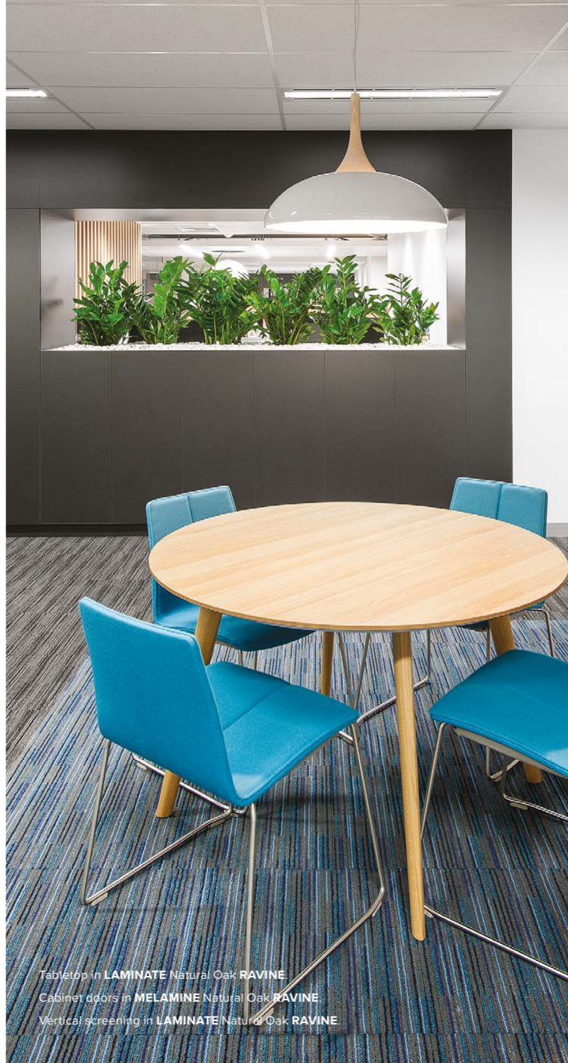
Tabletop in LAMINATE Natural Oak RAVINE Cabinet doors in MELAMINE Natural Oak RAVINE Vertical screening in LAMINATE Natural Oak RAVINE