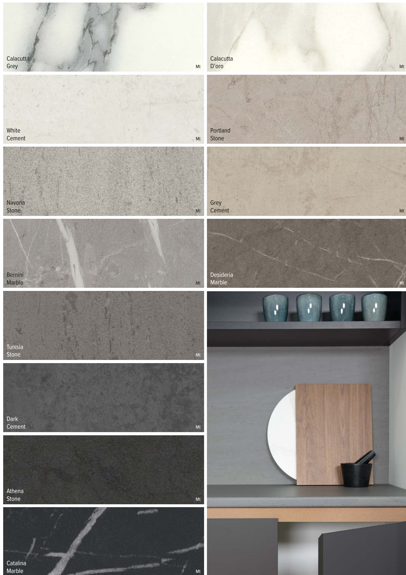
Available finishes Mt = Matera

polytec swatches and samples represent a small area of the overall colour structure. To view the large colour sample, visit www.polytec.com.au . Dark coloured surfaces will show fingerprints and require more care and maintenance than lighter coloured surfaces. It is recommended to test a product sample prior to colour selection.