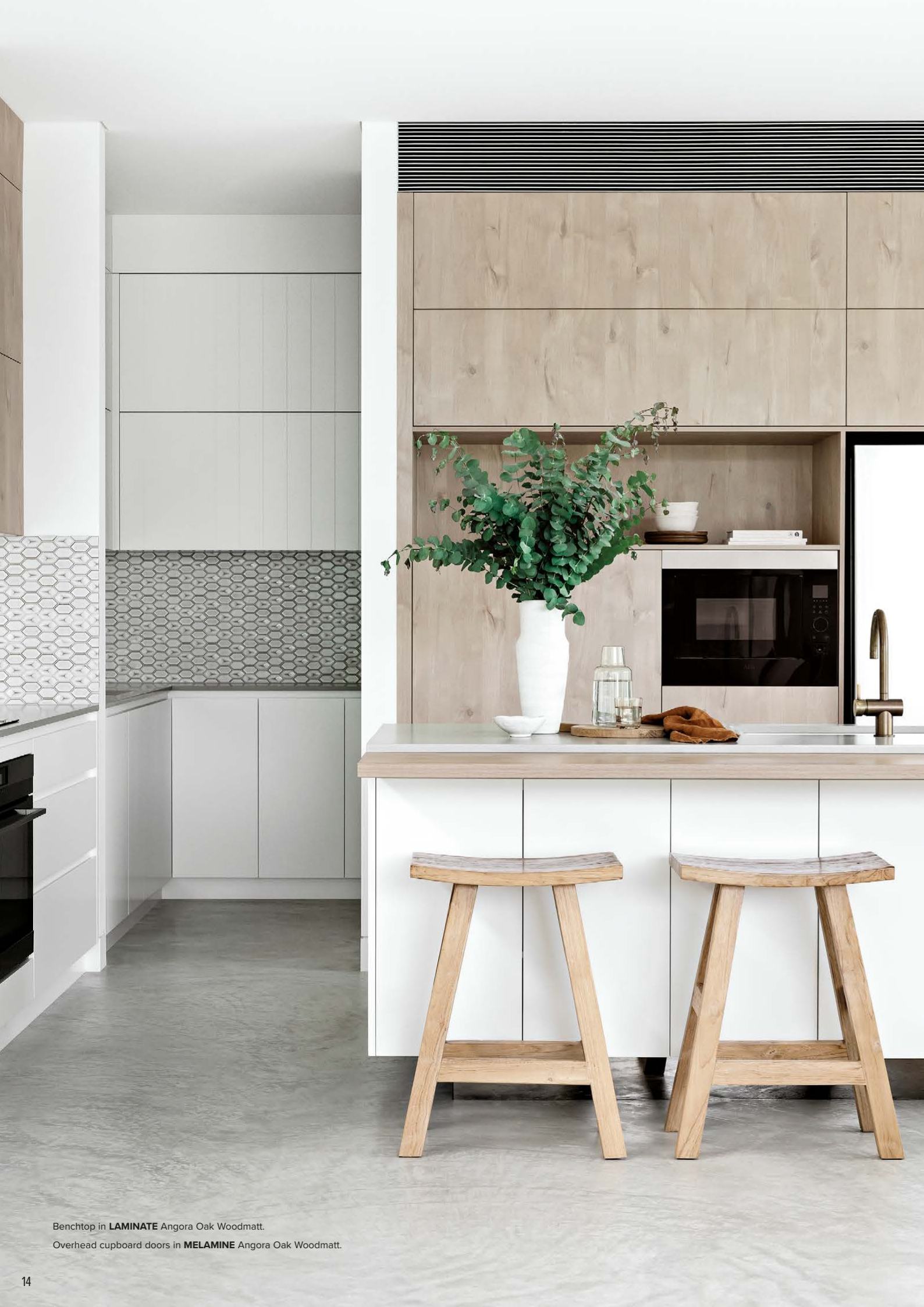
Benchtop in LAMINATE Angora Oak Woodmatt. Overhead cupboard doors in MELAMINE Angora Oak Woodmatt.